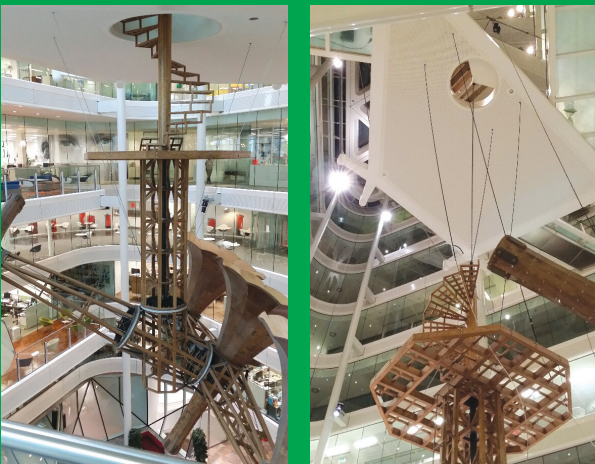
In 2013 we advised and helped before and during the install to get this sculpture perfectly placed in the atrium of Unilever House.